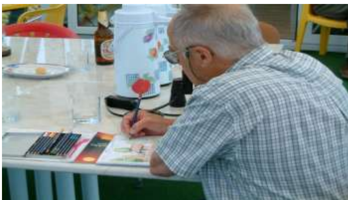
Time for a spot of painting

Bar bills can be settled in Euro or by credit card in the land based Hotels, but not credit card on the Floating Hotel.