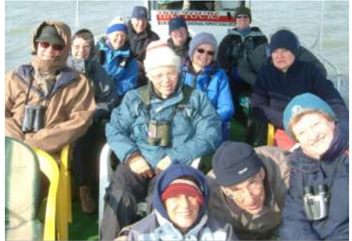
The converted lifeboat for exploring the narrower channels in the Danube Delta.

The cabins are small and simply appointed, about 2 metres wide by 3 metres long, and have a porthole to see outside. There is very little storage space, so suitcases and most of your luggage is best stored under the beds. It is like having a berth on a small yacht. We and our guests have found the Floating Hotel very comfortable and well maintained.