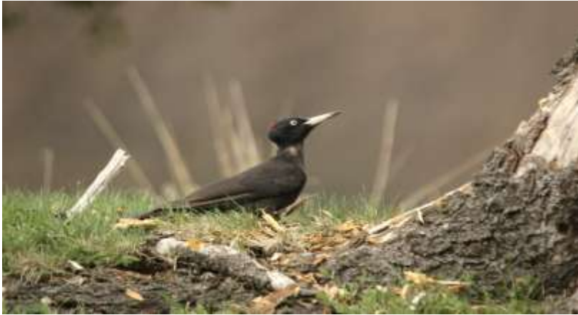
A female black woodpecker

We do not aim to chase around seeing as many species as possible, but rather to help you identify birds and flowers as we come across them, by visiting a wide range of habitats.