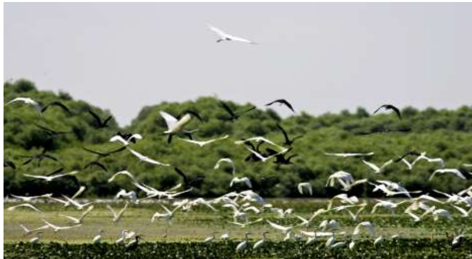
Egrets and Ibises in the Danube Delta

The Danube Delta is not just the world's largest reed bed, but has dense woodlands of ash, willow, oak and poplar, plus grazing marshes, man-made fish ponds, orchards and small fishing and reed gathering villages. Bird specialities include both Dalmatian and white pelicans, ibises, egrets, pygmy cormorant, ferruginous duck, red-necked & black-necked grebes, Savi's warbler, white-tailed eagles, hobbies, harriers, marsh terns, bitterns, penduline tits, rollers, bee-eaters, etc. The vastness of the Delta and sheer numbers and quality of birds is spectacular.