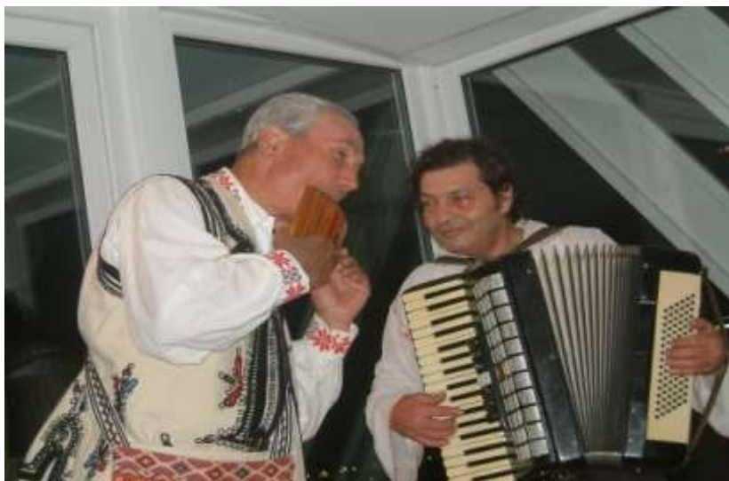
Some local musical entertainment