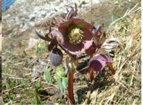
An alpine pasque flower

On our past trips we have seen about 180 species of birds and a wide variety of wild flowers, plus a few mammals such as deer, wild boar, otter and wildcat.