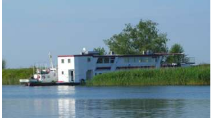
Floating Hotel moored for the night in the Delta.

The Danube Delta is not just the world's largest reed bed, but has dense woodlands of ash, willow, oak and poplar, plus grazing marshes, man-made fish ponds, orchards and small fishing and reed gathering villages. Bird specialities include both Dalmatian and white pelicans, ibises, egrets, pygmy cormorant, ferruginous duck, red-necked & black-necked grebes, Savi's warbler, white-tailed eagles, hobbies, harriers, marsh terns, bitterns, penduline tits, rollers, bee-eaters, etc. The vastness of the Delta and sheer numbers and quality of birds is spectacular.