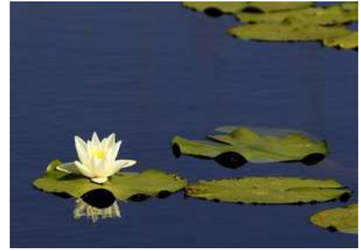
Water lilies abound in the Delta

We will visit Letea, the village where Daniel our Guide grew up. It is now a conservation area using only traditional building materials and techniques. No motorized vehicles are permitted in the Delta forest, so we will enjoy a trip with horse and cart to get to a tiny desert in its midst.