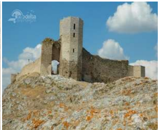
Medieval Fortress of Enisala

The country was composed of three areas, Transylvania, Wallachia and Moldavia, each of which had its own chequered history. The borders were rather fluid, and the country took its present form after the Second World War. As you might imagine, it was often necessary for Romanians to defend themselves from invaders from the Black Sea, and the remains of fortifications from different periods reflect this.