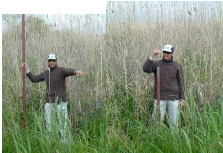
..... And demonstrating the ecology of the Delta.