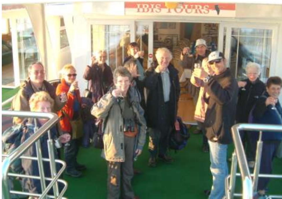
“Three Cheers for your trip to Romania”