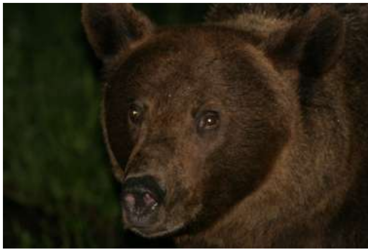
A Brown Bear in the woods

The Danube Delta is incredibly rich in breeding birds. For example Romania hosts the world's largest population of the globally threatened pygmy cormorant with over 7000 pairs, and most are here in the Delta. There's also Europe's largest population of Eurasian white pelican about 3500 pairs, crucial numbers of Dalmatian pelican and the core European population of ferruginous duck. Europe's largest lesser grey shrike population also breeds here. Many Locustella and Acrocephalus warblers such as savi's, sedge, paddyfield, moustached, marsh, reed, great reed warblers have their largest European breeding populations in Romania.