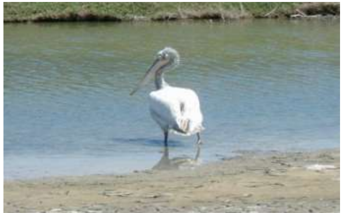
A Whiskered Tern and a rare Dalmation Pelican which has the largest wingspan of any bird in Europe at over 3 metres.

Typical sights include feeding glossy ibis, egrets, herons, and cormorants, which can gather in impressive numbers where the water levels are low. Large flocks of white pelicans glide serenely overhead whilst in the shallower channels kingfishers are ubiquitous and common sandpipers, green sandpipers and greenshanks feed along the banks. The reeds fringing the waterways contain families of penduline tits and other reed bed species such as little bittern.