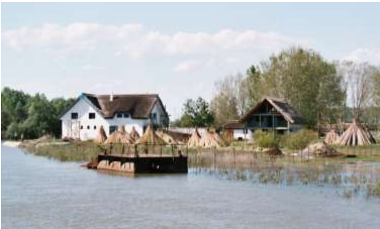
Reed stacks in the Danube Delta

On our past trips we have seen about 180 species of birds and a wide variety of wild flowers, plus a few mammals such as deer, wild boar, otter and wildcat.