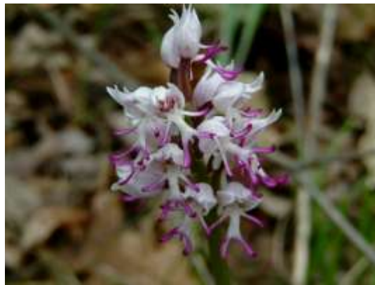
Naked Man Orchid in Babadog forest