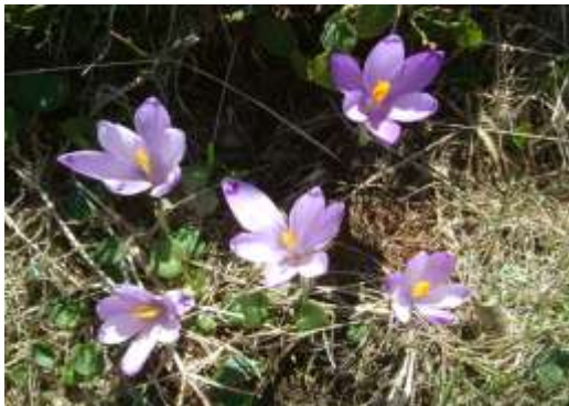
Alpine purple crocuses

The fourteenth century Fortress of Enisala, built on the site of earlier fortifications, makes an interesting diversion and is a good vantage point for birds of prey.