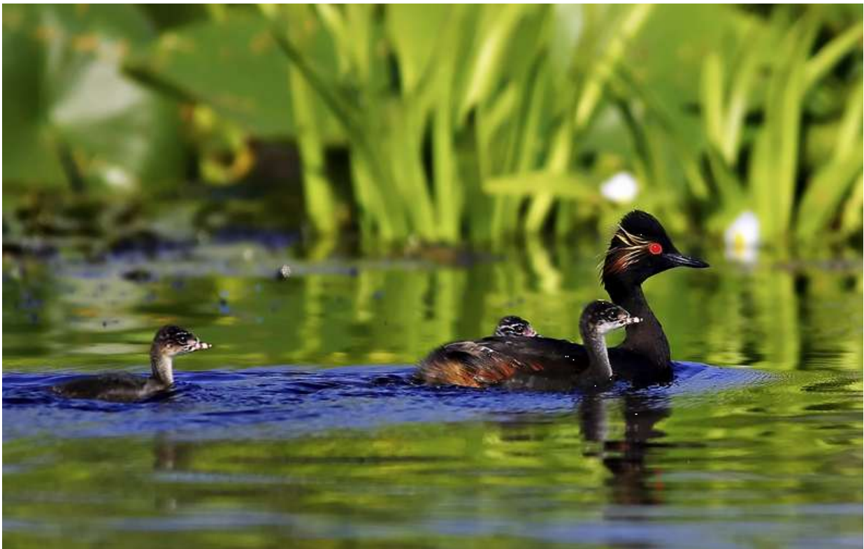
Black-necked Grebes in the Danube Delta