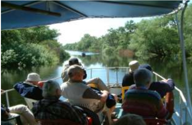
Peace & Tranquility in the Delta.

In 1990 the Danube Delta was declared a UNESCO Biosphere Reserve.