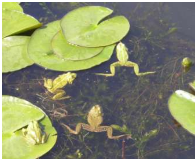
Frogs croaking in the Delta.