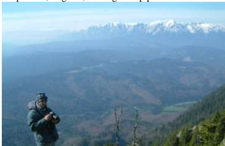
In the Carpathian Mountains.

The Carpathian Mountains form the backbone of Central and Eastern Europe. They are famed for their wildlife, which lies hidden in vast ancient forests where brown bears still roam. We will attempt to see wild brown bears one evening, on a special excursion to their woodland habitat. Mountain and forest birds include ring ouzels, alpine accentors, raptors, woodpeckers, wagtails, buntings and pipits.