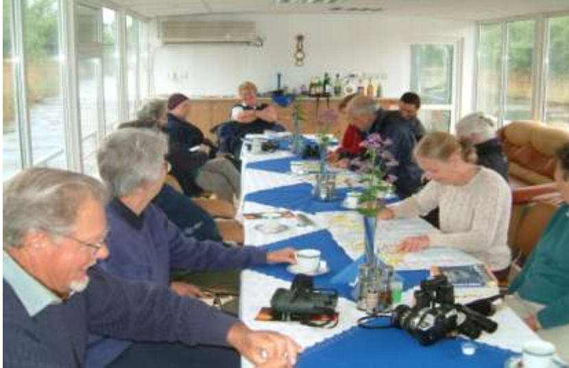
Working out where we have been and where we are going next!

We think Romania is a terrific Holiday destination at a time of year when the wildlife and scenery especially are at their very best.