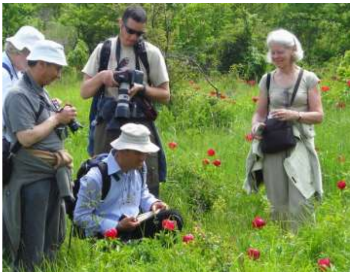
Amongst wild paeonies in the Steppes.

All drinks from the bar, telephone calls, laundry costs, and other things of a personal nature.