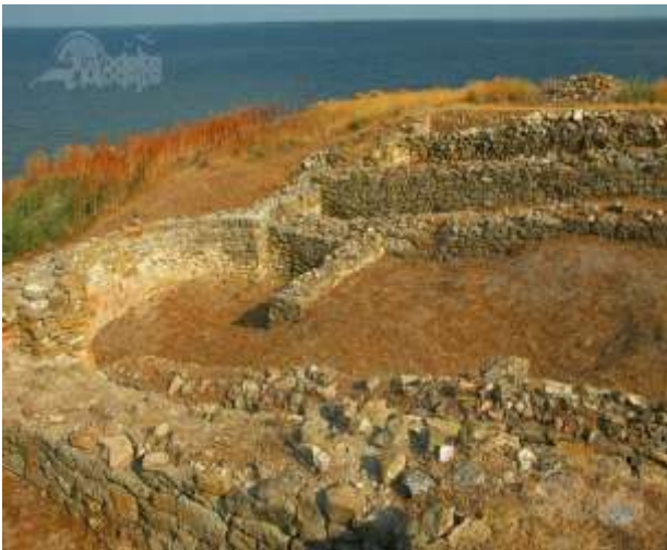
Argamum Archaeological Site

The sites we can visit are much more ‘modern’, the earliest being from the first millennium BC when this region of Romania was part of the Greek Empire. Later it was the Dacian Kingdom. The Romans became overlords as late as 106 AD and called it Roman Dacia, but it was the first province to be abandoned in 271 AD when the contraction of the Roman Empire began. However the ‘Roman’ name stuck and survives to this day.