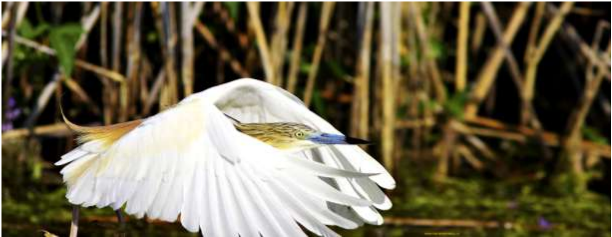
A beautiful Squacco Heron

We will send confirmation of your booking on receipt of your completed booking form and deposit payment. Then when your balance is paid 10 weeks before departure, we will send you suggestions of what clothing and other things you might bring with you, suggestions about a few identification books that may be useful, a bird check list and any other relevant pre-departure information.