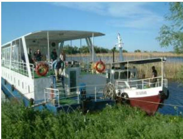
The Floating Hotel moored up in the Danube Delta.

The Floating Hotel provides us with a really special and comfortable mobile home, with small, but modern ensuite cabins. The food on board is excellent, and the scene from the restaurant panoramic. There are spacious wildlife viewing areas in the stern for us to enjoy the changing scenery as we motor along. We explore narrower twisting channels in specially converted lifeboats. The Romanian Floating Hotel is probably a novel concept for most of us. The advantages are that our home comes with us as we explore the Delta, and gives us the flexibility which land based Hotels cannot offer. We can wake up in different parts of the Delta each day and also enjoy the silence and peace of the Delta at night. It is a wonderful experience.