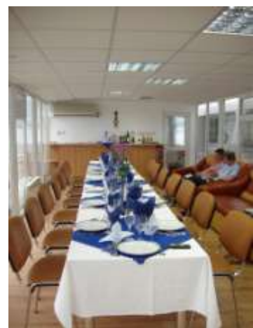
Ready for dinner on board.