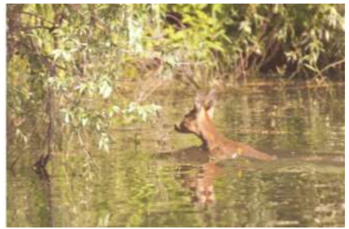
Roe deer swimming